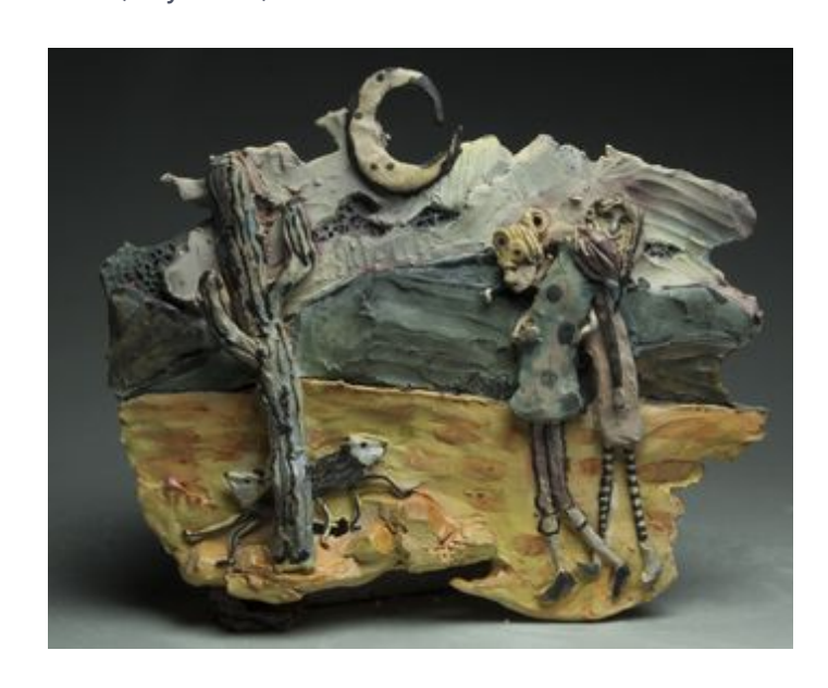
Paint, Plywood, Pastel