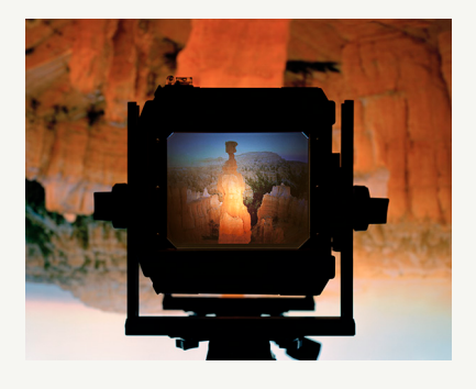
COVER ART: Zion by Clint Baclawski

Massachusetts College of Art and Design is one of the leading schools of its kind in the United States. Founded in 1873, MassArt has a legacy of leadership as the only independent public college of art and design in the country and the nation's first art school to grant a degree. The college offers a comprehensive range of baccalaureate and graduate degrees in art and design along with continuing education and youth programs, all taught by world-class faculty and designed to encourage individual creativity. Whether at home in Boston or on the other side of the globe, the artists and designers of MassArt are dedicated to making a difference in their communities and around the world.